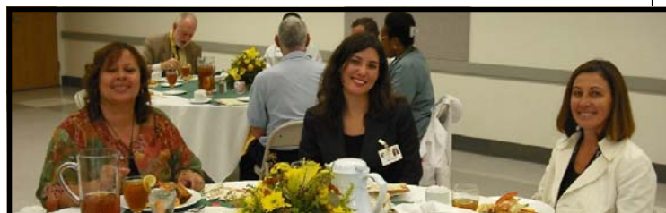
Enjoying the lunch

And thank you to all who have renewed your membership this year. I know you will find it a