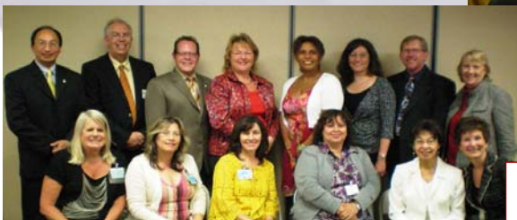
Our new Chapter Board