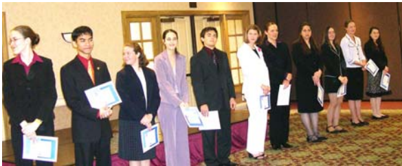
Speech contestants from Southwest, Pacific North and Pacific South Areas