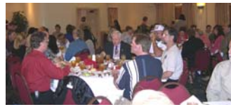
Recognition Luncheon where 2004 awards were presented