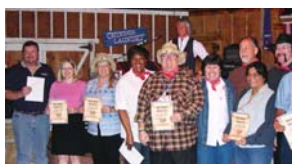
Hottest chili winners con- sisting of several SCAC members