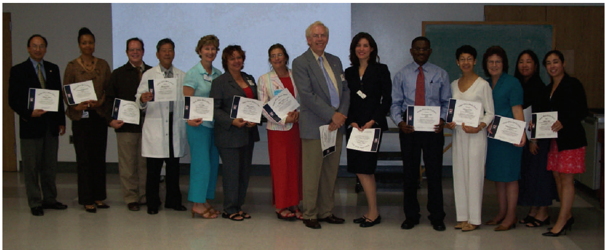
Previous Board of Directors of 2006/2007. The list of names can be found on the last page of the newsletter.