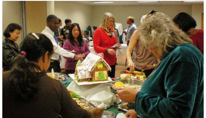
People gather around the dessert table during their homemade dessert contest