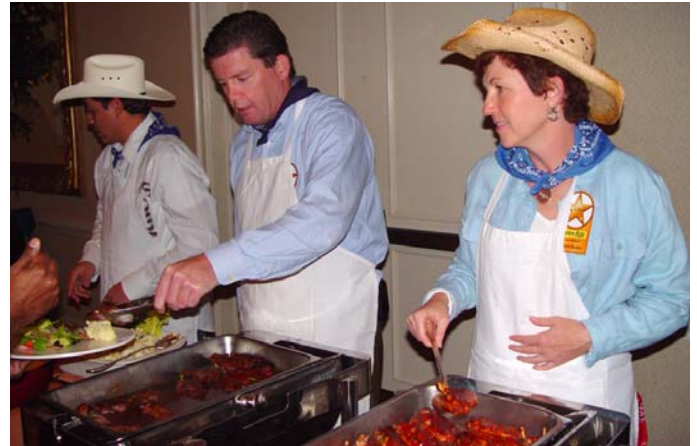
Executives serving the grub to attendees at the Western Night

The 4 th Qtr of 2010 for BALC was icing on the cake for a great year's end. October hosted Western Night—always a smash. It was held at the Waterfront Hilton in Huntington Beach. The “Saddle Sores” band provided great western musical entertainment. Also, the new BALC 2011 BOD members were announced, and received a hearty round of applause.