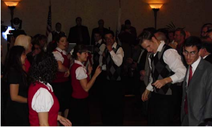
A whole lot of dancing was going on the BALC Holiday Party

supporting the Speech contest, as well as a fundraiser providing toys and cash donated to several youth groups in Orange County. There also was a ballroom dance group hired to entertain the party and give dance lessons, which also stayed through the event engaging members to dance and passing out party favors—they truly helped make the evening a great success and lots of fun.