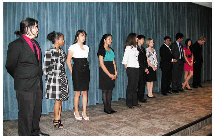
Eleven Speech contestants of the March 4th Speech Contest

For those who have been with the contest since its inception, the BALC event was proof once again that our future leadership is in good hands.