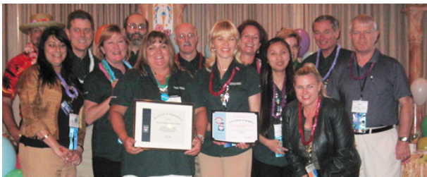
Boeing Aerospace Leadership Chapter (BALC) receives awards at the NMA National Conference

Sunday also featured the always raucous Recognition Luncheon, where chapter and council awards were presented. Of special note for the Southern California Area Council (SCAC) and its associated chapters were the following awards: City of Orange, First Place Publications; Boeing Aerospace Leadership Chapter, Outstanding Chapter, 3 rd Place Publications; SCAC, Outstanding Council, 1 st Place Publications.