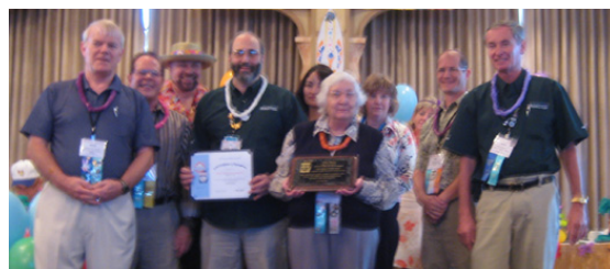
Southern California Area Council (SCAC) receives awards at the NMA National Conference