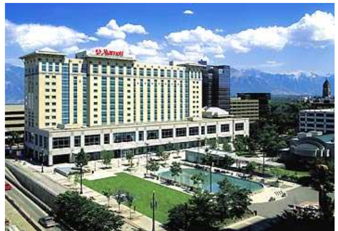
Marriott Salt Lake City City Center

The Southern California Area Council (SCAC) is looking forward to seeing many chapter and council members in Salt Lake City!